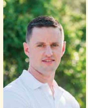
VP of Programs, TrueCharity