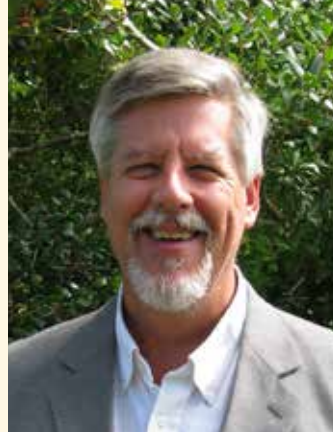
Founder, Cornwall Alliance