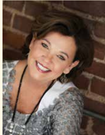
Thursday Evening Concert