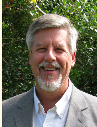
Founder, Cornwall Alliance