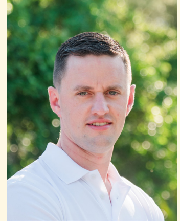
VP of Programs, TrueCharity