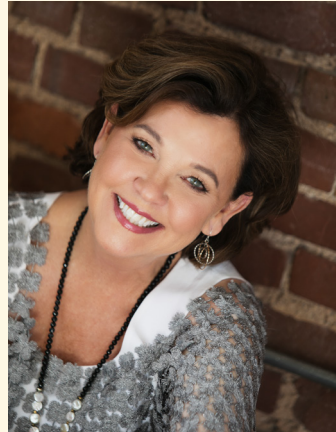
Thursday Evening Concert