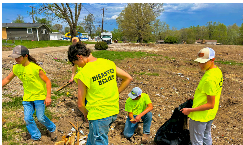
Sullivan FFA crew picking up tornado trash in Sullivan, IN. Over 150 homes destroyed by the EF-3 tornado