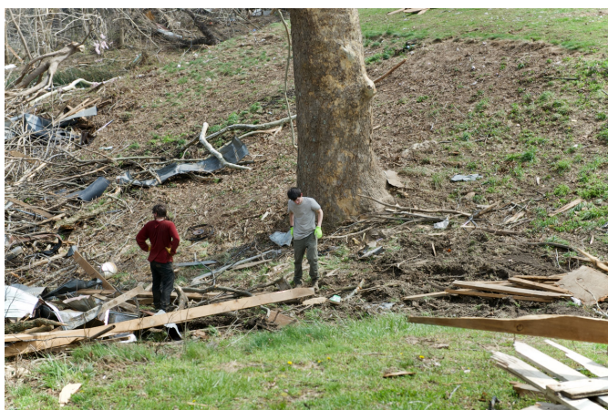
Rural damage included downed trees, and tornado trash on soon to be planted corn and soybean fields.