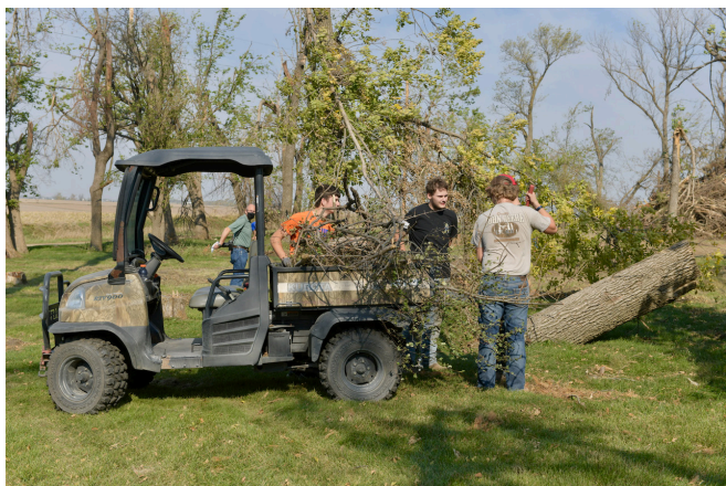
FCFI Kubota side by side with trailer was delivered to the Sullivan FFA Chapter shop for use by FFA teams responding to the community requests for help.