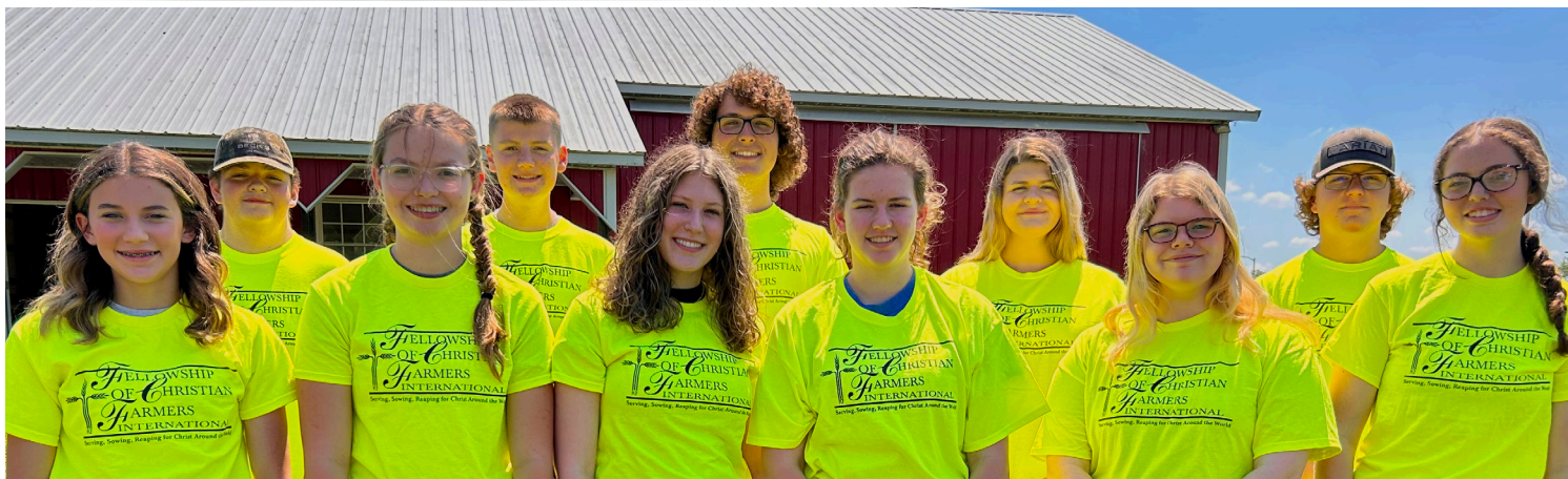
Sullivan FFA chapter tornado disaster relief, Sullivan Indiana