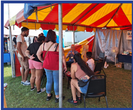
Olcott Bible Church as always staffed the FCFI Tent at the Niagara County Fair in Lockport, NY Great results - They talked to 800 people and had 42 decisions for Christ.