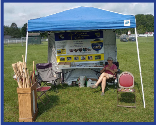
Anne Fleming ready to share at the Bradford Fest in VT. The weather turned rainy, but the Flemings still passed out 300 sticks and had several folks ask for prayer.