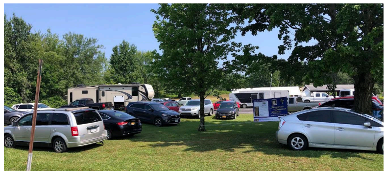
The full parking lot at Pilgrim Holiness Church, Marcy, NY during stick days. Folks came by camper and car to help.