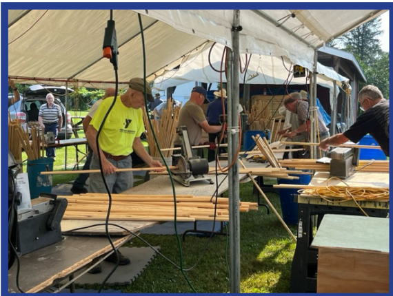
Lots of folks sanding sticks