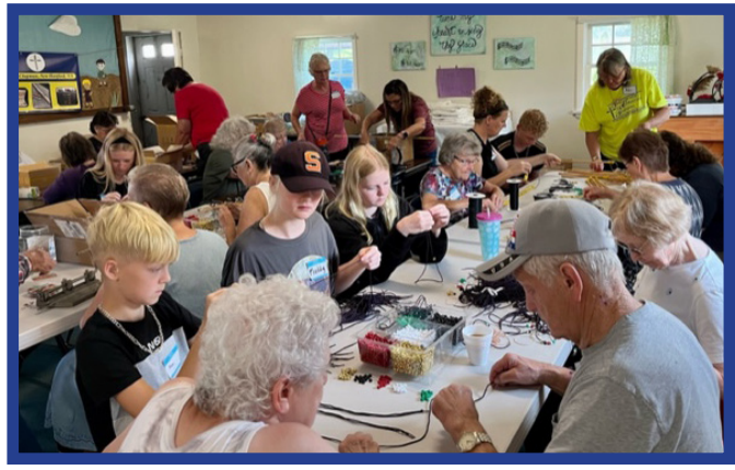
Work for everyone at Stick Days. Over 15,000 necklaces, bracelets and other items, etc.