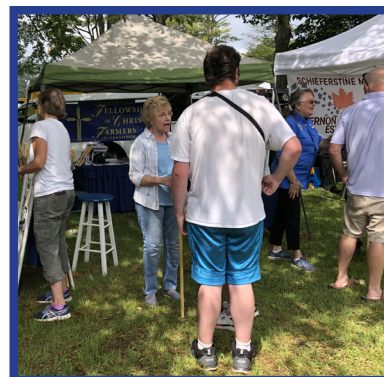
Busy tent at Old Home Day in Vernon Center, NY