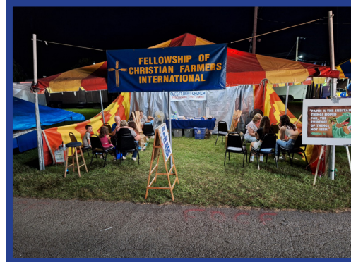
Nighttime at the fair. Olcott Bible Church looks good in the FCF carnival tent!