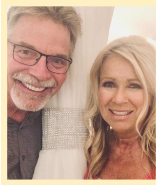
Martindale Community Church Chaplain To FCFI