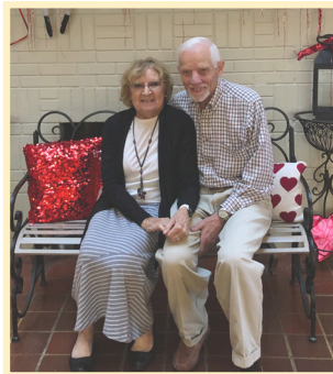
"Committed to each other and to Him"