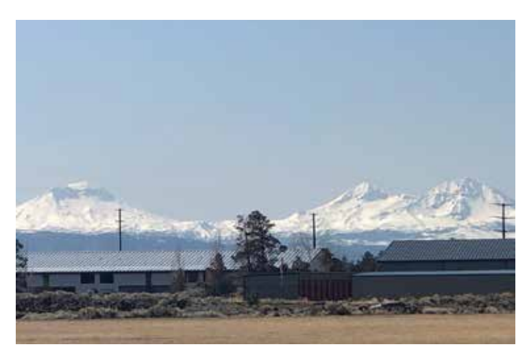
Three Sisters mountains near Bend, Oregon