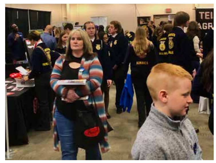
Oregon State FFA Convention.

The Fellowship of Christian Farmers, International began its participation at State FFA Conventions in Oregon, Nebraska, and Iowa . As many as 30 states will welcome FCFI at their state conventions. The Fellowship has a long history with FFA/ Vocational Education in high school and collegiate levels. This year we have some agribusiness and spiritual goals we are striving to achieve.