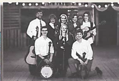
Saturday Evening Concert