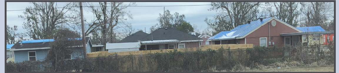
Lots of roofs covered with blue tarps.

Special thanks to Ralph Shallenberger, from the main office for providing hearty meals to keep us going.