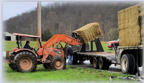
↑ Unloading 1,500 lb. bales of hay. Farmers commented that FCFI was one of the few organizations that actually stepped up to help in their time of need