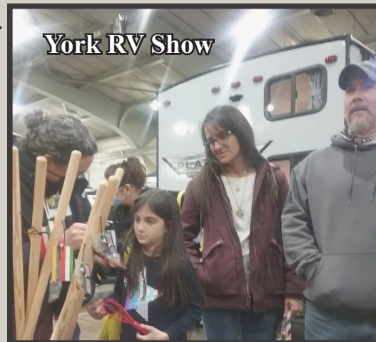
York RV Show