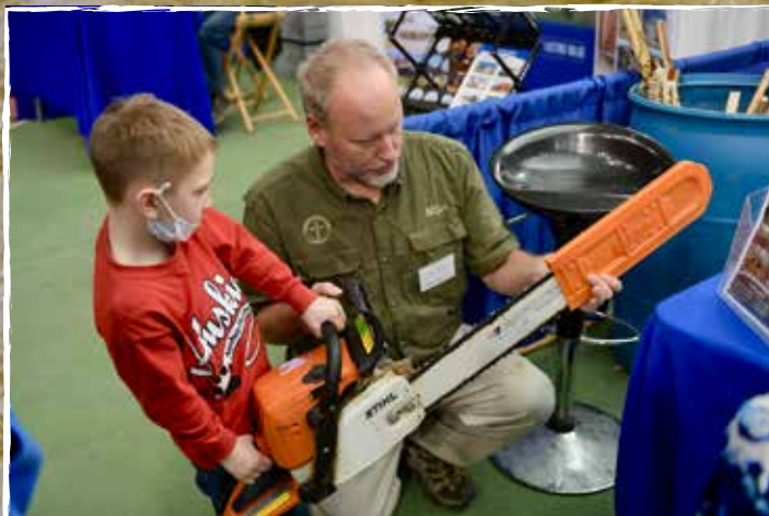
Farm Shows re-opening in 2021