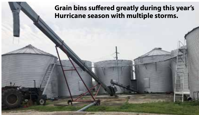
Grain bins suffered greatly during this year's Hurricane season with multiple storms.

Calcasieu Parrish pastures were supersaturated for a long time. Fence repair had to wait to avoid excess damage to fields. South Louisiana will have long term disaster relief need. There will be fences to build in the fall of 2021. Prayfully consider organizing a South Louisiana fence building crew and contact the FCFI Home Office when you are ready.