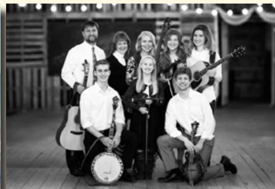
Saturday Evening Concert