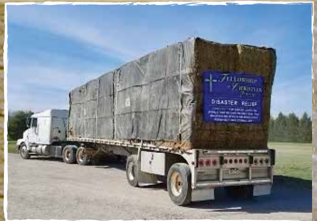
Truckloads of hay shipped to South Louisiana and the Kentucky River

Sowing, Serving, Reaping for Christ Around the World