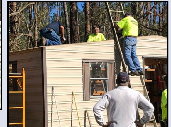
The new building looks great. Two storage building were destroyed but both were back in good repair at the end of the day.