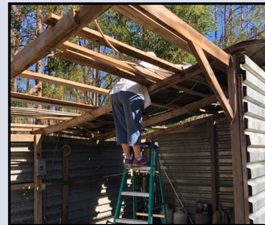
Deb Herrold removing old roofing before replacing rafters, and new steel.