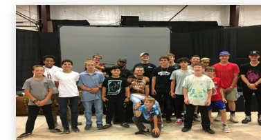
LUC-"A Place Where Lives Are Being Changed."

Please watch the short video from LUC and if interested in participating contact: FCFI (309) 365-8710 or fellowship@fcfi.org Additional contact: cpfoster8@yahoo.com