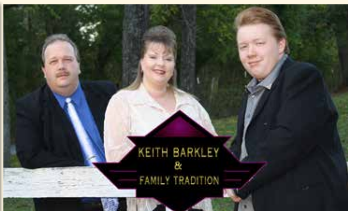
Saturday Evening Concert