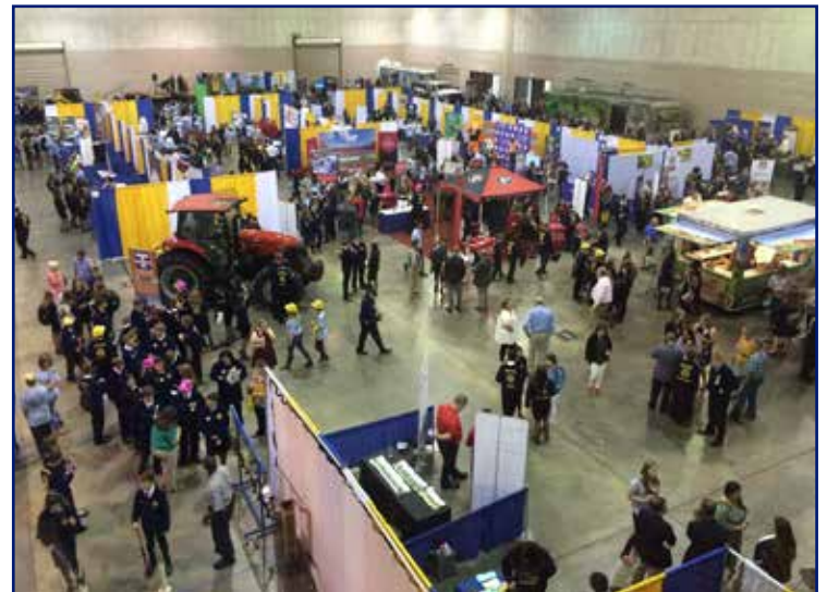
View of the 2019 Georgia State FFA Convention Career Show.

The Georgia State FFA Career Show featured a wide variety of career opportunities. Trade schools, Technical colleges, Universities including Louisiana State University, Tennessee, and the University of Georgia. Students learned about the Fellowship of Christian Farmers organization that involves high school students in disaster relief projects and collecting used shoes for shipment to countries where shoes are needed. Gospel presentations are made in the FCFI booth. Many students desire to get extra “free stuff” so they can share the gospel with their friends.