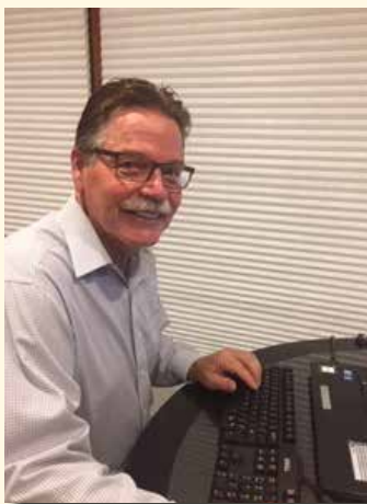
Pastor, Assistant to the FCFI Executive Director