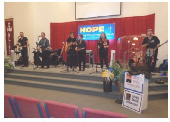
Weaver Believers from GA provided the music \uparrow on Saturday night