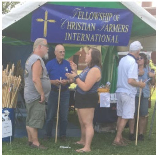
Eden Corn Festival. The area is known for it's sweet corn production. The annual event held in August, has been very productive for FCF with over 1,000 stopping by the tent. The young lady in the picture is signing for her Dad. The message goes forth in many forms.