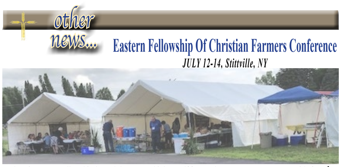
Redeeming Love Fellowship hosted the event which saw 139 attendees. Tents were set up outside for \uparrow eating and fellowship.