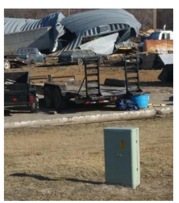
View of flood destruction

the stockyard about as fast as it was being brought in from all around the country. What an opportunity God is providing in the midst of the flooding disaster to show God's love. The contemporary version of James 2:16 relates you shouldn't just say "I hope all goes well for you. I hope you will be