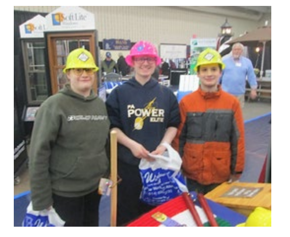
The Home Builders Show was held in Williamsburg, PA in February. Pictured are three young adults all excited to show off their new FCFI construction Hats. One has her walking stick in hand.