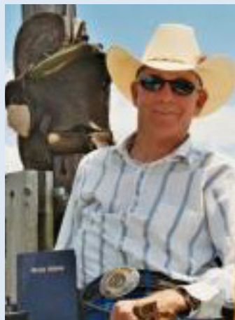
Cowboy, Rancher, Preacher Reality Ranch, Zolfo Springs, FL