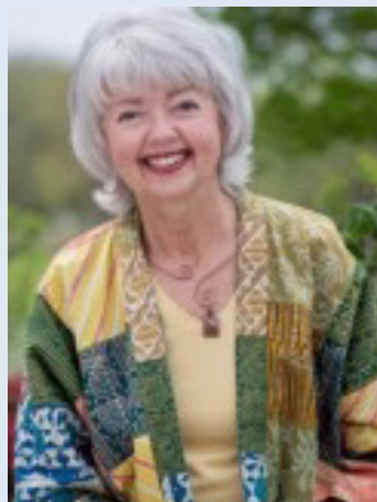
Author of "Forgiven: The Amish School Shooting, a Mother's Love, and a Story of Remarkable Grace"