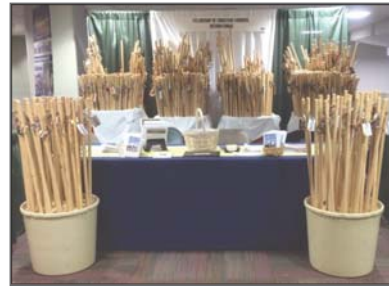
Sticks and more sticks at the Memphis Cotton and Gin Show. The show remains one of the largest indoor shows in the south.

-The Gold Bead – “The Street of heaven was pure gold, as it were transparent glass”. Rev. 21:21. We all want to spend eternity there. John 3:16 – “For God so loved the world that He gave His only begotten Son.” -The Dark Bead - represents sin. Sin separates us from God. Romans 3:23 – “For all have sinned, and come short of the glory of God.” -The Red Color - represents the blood of Christ. - Romans 5:8 – “But God commends his love for us, in that while we were yet sinners, Christ dies for us.” When we accept Christ as our savior our sins are washed White as snow. Isaiah 1:18 We're forgiven. Romans 10:9 – “Confess with your mouth and believe in your heart that God raised Christ from the dead, and you shall be saved.” -Finally the Green Bead - Once we accept Christ as our savior there will be spiritual growth. II Peter 3:18 – “But grow in grace and knowledge of our Lord and savior, Jesus Christ.”