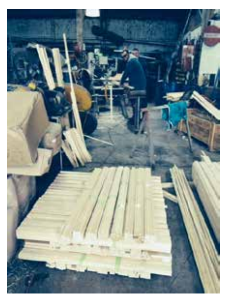
Farmers in the Gordonton area teamed up to cut 2400 walking sticks.

One of the Capernwray lecture halls was converted into a final wordless walking prep station. Final sanding and the rawhide bracelets were tied onto the walking sticks. Bundles of 25 sticks were taped together for easy transport to the farm show.