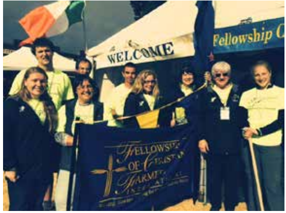
Our team of six Capernwray Bible School students from Canada, New Zealand, and Wisconsin in front of the FCFI NZ tent exhibit at National Fieldays, June 11-14 in Hamilton.

A framed style tent, 3 m X 6 m, with six flags representing countries that attend National Fieldays was used at this year's exhibit. FCFI NZ had a great location at a crossroads of traffic with no neighboring exhibitors beside us.