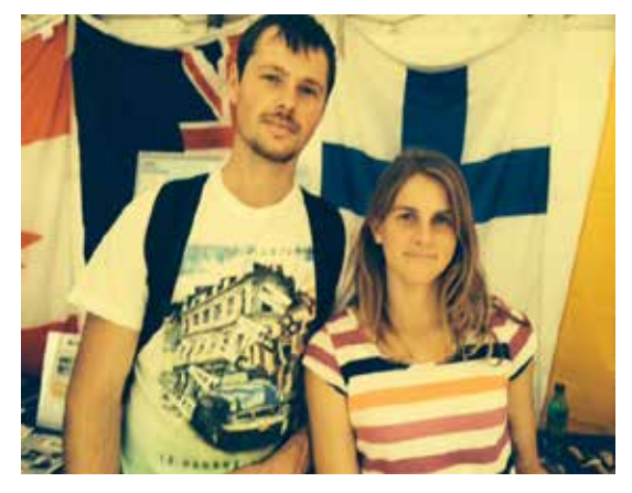
This young lady and her husband visited the FCFI NZ tent this year to tell us she accepted Christ in the Fieldays tent last year. She and her husband are growing in the Lord and are plugged into a church recommended by Capernwray. It was thrilling to hear her testimony.

One of the Capernwray lecture halls was converted into a final wordless walking prep station. Final sanding and the rawhide bracelets were tied onto the walking sticks. Bundles of 25 sticks were taped together for easy transport to the farm show.