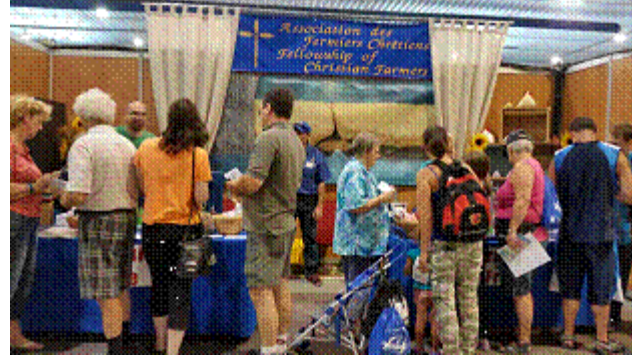
Photo: Agricultural Fair, Saint-Hyacinthe, Quebec: 7000 people reached annually.

Our chapters are growing and maturing rapidly. We see the hand of God accompanying and leading them in their mission consisting of reaching the lost for Jesus. We can see that God uses FCFC not only as an evangelization ministry, but also as a school for making disciples.