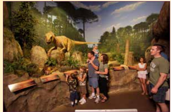
Creation Museum guests observe the life-size, animatronic Utahraptor, a velociraptor-type dinosaur whose remains were discovered in Utah in 1993.