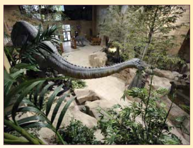
Main Hall – An animatronic 40-foot-long sauropod dinosaur overlooks The Creation Museum's large main hall. Other dinosaurs that also move realistically are placed here too.