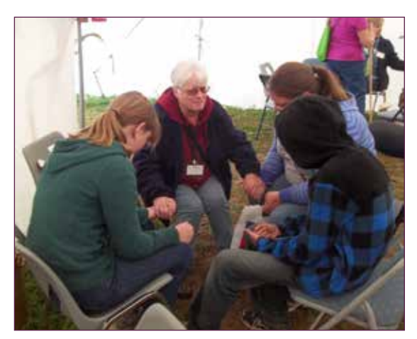
At the International Plowing Match, on a chilly, damp day in September, people claimed Jesus Christ as their Saviour.

For a complete listing of upcoming shows in Canada please visit our website: www.fcfi.org