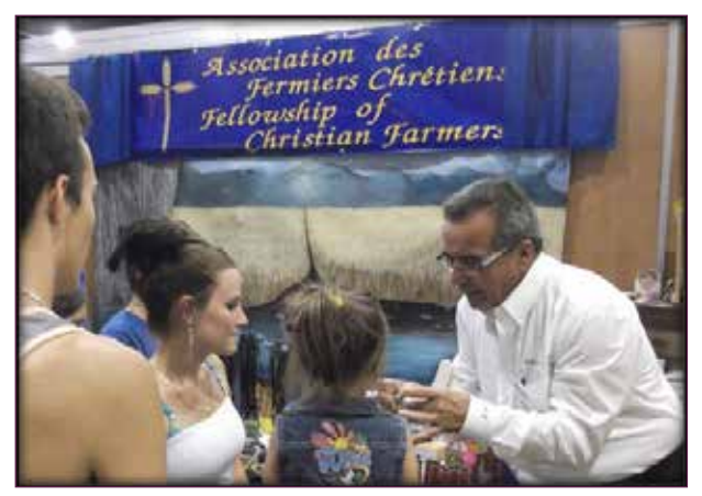
In French Quebec alone, more than 400 volunteers coming from 60 churches, shared the gospel with over 43,000 people. At left: Expo Saint-Hyacinthe

After hearing the testimonies of volunteers, we agree with Harvey Buck, one of our members, who said: "I'm excited to see what's coming down the road. I've got a heart to see this country turned upside right!"