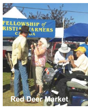
Red Deer Market