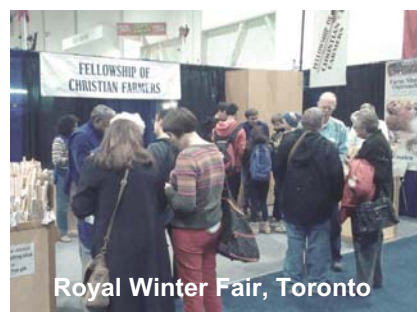
Royal Winter Fair, Toronto