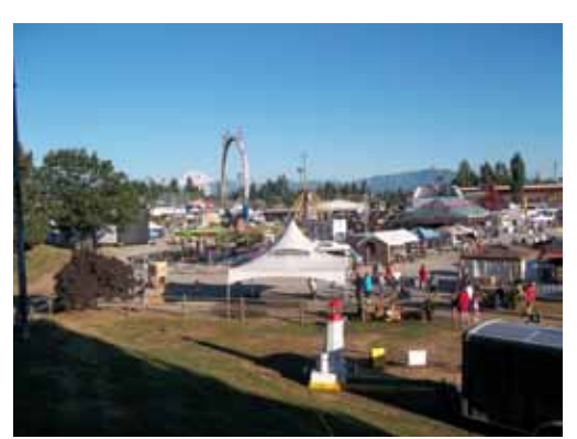
Abbotsford Agrifair with snow-capped Mt. Baker in the distance.