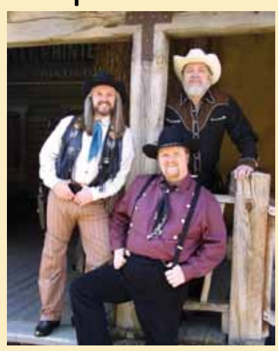
Sons of the Silver Dollar performing vocal group at Silver Dollar City