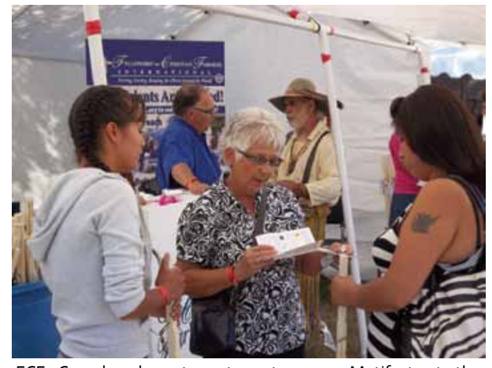
FCF Canada plans to return to 2012 Metifest at the International Peace Gardens