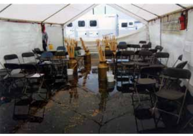
Water everywhere at the Sun Belt Ag Expo in Moultrie, Georgia! Georgia is in a drought situation so the rain was welcome. It is hard to work in the tent with three inches of standing water.