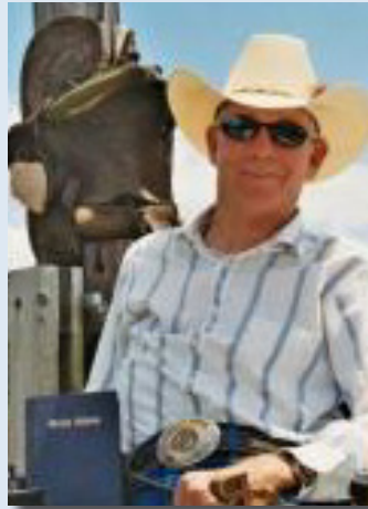
Cowboy, Rancher, Preacher Reality Ranch, Zolfo Springs, FL