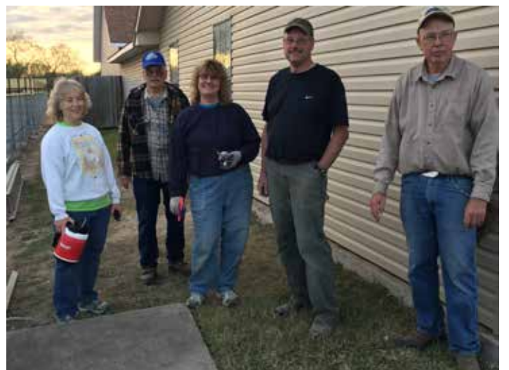
The congregation there was so thankful that they made wonderful Mexican meals that were enjoyed by all. We enjoyed volunteering and helping our Brothers and Sisters in Christ, as they serve our Savior and try to win souls for Christ, down in the valley in South Texas.