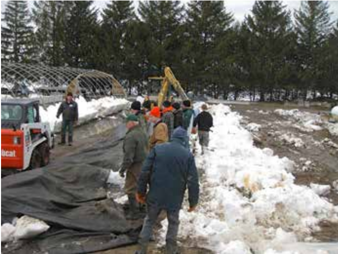
LEFT We had upwards of fifty volunteers come to help. In the morning, there was a huge mess, but by 4pm, all was cleaned up, and one new greenhouse had the foundation anchors in the ground ready for hoops.