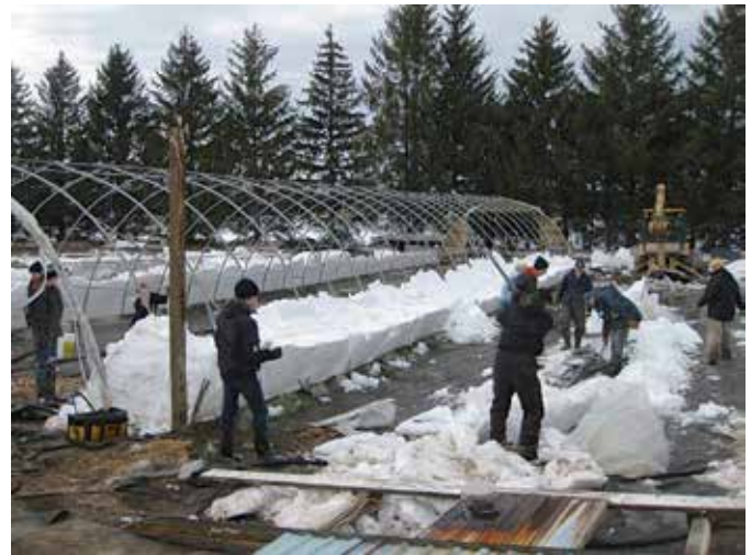
It was truly amazing how fast the clean up was accomplished.