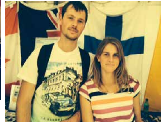
This young lady and her husband visited the FCFI NZ tent this year to tell us she accepted Christ in the Fieldays tent last year. She and her husband are growing in the Lord and are plugged into a church recommended by Capernwray. It was thrilling to hear her testimony.

One of the Capernwray lecture halls was converted into a final wordless walking prep station. Final sanding and the rawhide bracelets were tied onto the walking sticks. Bundles of 25 sticks were taped together for easy transport to the farm show.