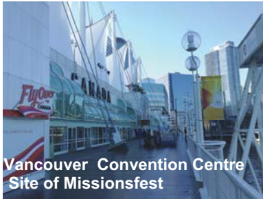
Vancouver Convention Centre Site of Missionsfest

Our vision is to train and equip Christians, through local chapters, to share the gospel in the marketplace with people in Canada from sea to sea.