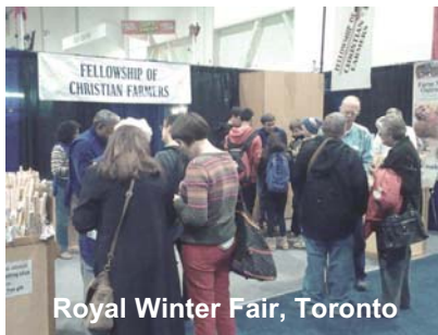
Royal Winter Fair, Toronto