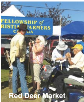
Red Deer Market